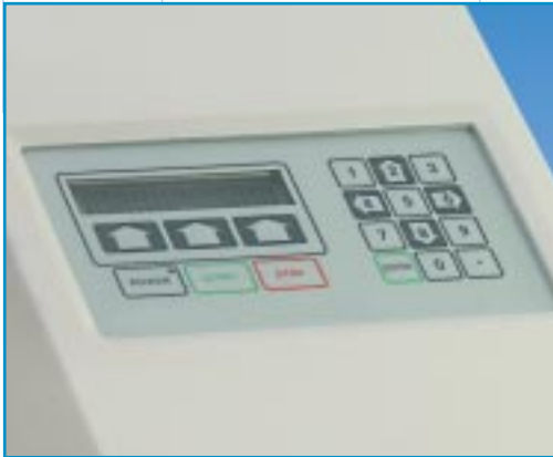
■ ■ ■ ■ ■ ■ ■ ■ LCD Control Panel